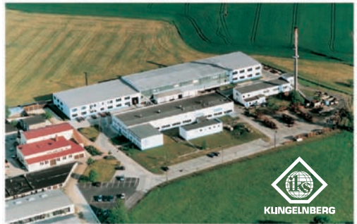
IKS KLINGELBERG, GERINGSWALDE / GERMANY