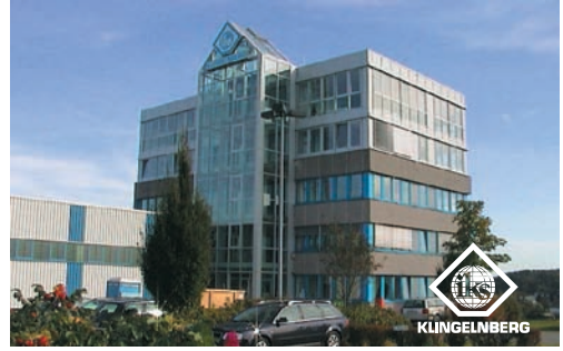
IKS KLINGELBERG, REMSCHEID / GERMANY